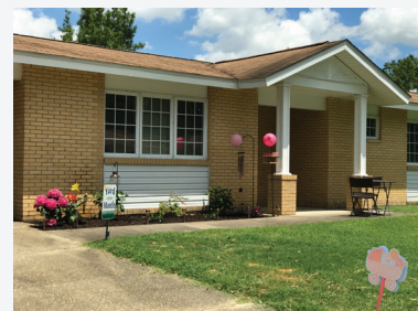
Hunley Park: 4035 Michigan Ave