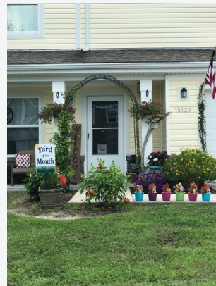
Main Base: 1512 James Unit A