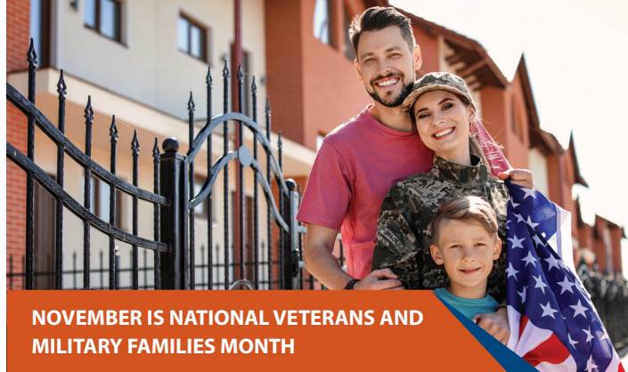
NOVEMBER IS NATIONAL VETERANS AND MILITARY FAMILIES MONTH