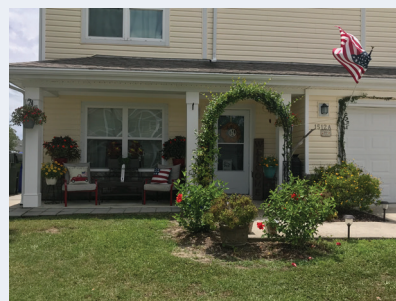
Main Base: 1512 James Ave Unit A