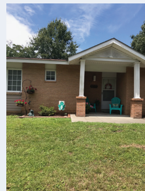
Hunley Park: 3719 Louisiana Ave Unit B